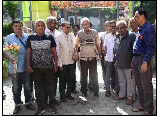
Com V.A.N with Pensioners