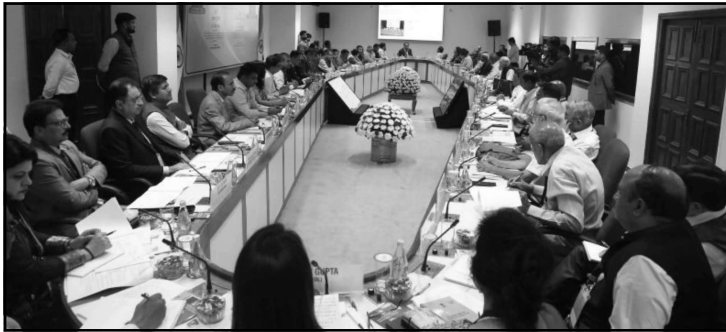
A view of the meeting in progress