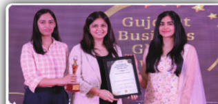
Best Patient Care Experience Award

Where Modern Technology meets Compassion - Complete Dental Care.. Crafting Smiles, Enriching Lives..