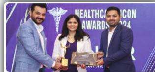
Best Multispeciality Dental Clinic in Gujarat Award