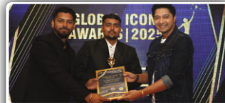
Award for Most-Trusted Dental Centre of Gujarat